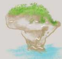
花瓶岩 Flower Vase Rock