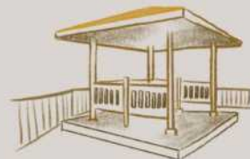
旭日亭 Sunrise Pavilion