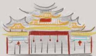
慈鳳宮 Ci-Feng Temple