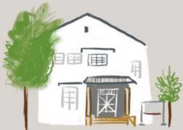
孫立人行館 General Sun Li-Jen Residence

Known in ancient times as Akaw or the "The Ol' Monkey", Pingtung is a place where restless crowds mingle with a laidback and down-to-earth vibe, as well as tradition dances with modernity. An excellent way to explore this city of harmonious contrasts is by foot, with a relaxing stroll to take in all the local sights.