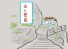
美人洞 Beauty Cave