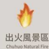
出火風景區 Chuhuo Natural Fire

Once known as Langjiao, Hengchun is the only place in Taiwan today that still preserves four intact castle gates. Tours of these and other significant landmarks are sure to furnish visitors with a memorable impression of how the past and present remain interlaced. While leisurely exploring the historical old streets of Hengchun, round off a very pleasant and relaxing day with a variety of delicious foods.