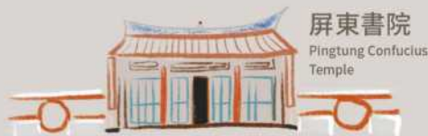
屏東書院 Pingtung Confucius Temple